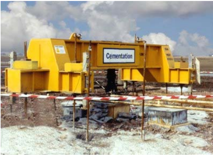
Fig 1 Ready assembled reaction system

piles. Fig 1, illustrates a 2MN assembly which takes less than 1 hour to erect and connect to the 2, 4 or 6 anchor bars. These types of reaction systems are also safer as their scope for collapse and fall is minimized.