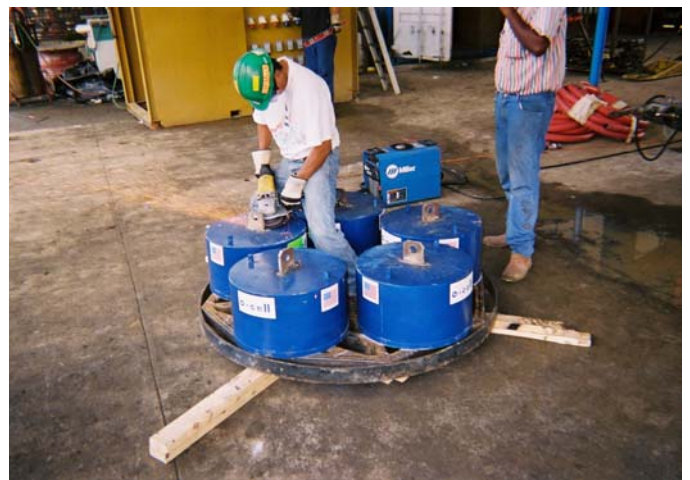
Fig 2 Assembly of multiple O-cells

The use of multiple jacks/cells can be used to advantage in a bi-directional test, it can even be an aid as the geometry of a multiple cell arrangement allows for concrete feed down the centre of the pile if required.